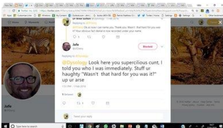
Original Twitter Account Tweet: Here Archived: Here